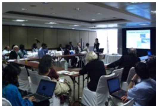
A presentation on marine IBA at the CBD COP11

So far, about 70 marine sites have been identified as the candidate marine IBAs in Japan. Marine IBAs are expected to be used for the conservation of marine ecosystem, and currently used as fundamental data to identify 'Ecologically and Biologically Significant Marine Areas' promoted by the Ministry of the Environment as well as the candidate construction sites of the offshore wind farms, which provides ecosystem-conscious energy supply.