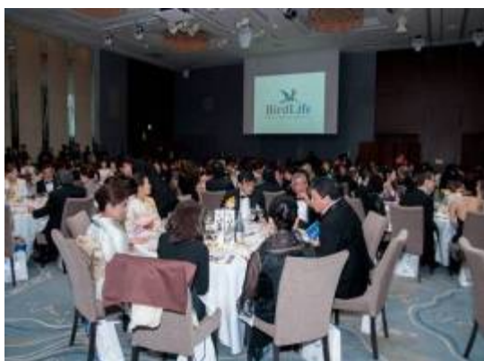
500 participants gathered

Since 2009, BirdLife International has held Gala Dinner in Tokyo for fund-raising for environmental conservation and has promoted tropical rainforests conservation. In 2012, we extended the area of holding Gala Dinner to Kansai region, and held BirdLife Spring Gala Dinner 2012 in Kobe on 2 March, which collected 7.03 million yen of donations. The proceeds from this event went towards nature conservation mainly in Asia including the Philippines,