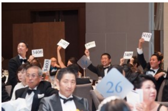
Fund-raising by auction