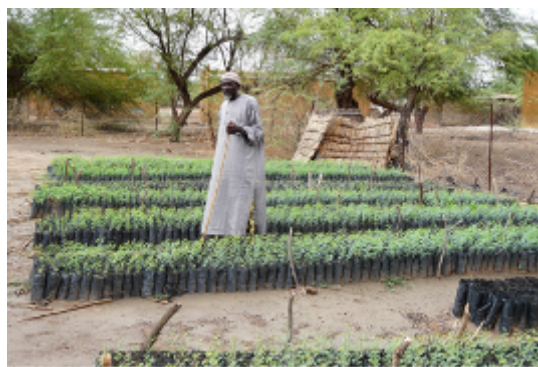
Nursing seedlings which are tolerant of dryness and grow fast