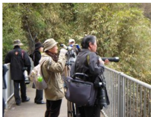
A bird-watching held in Kobe city in March

Birds are excellent indicators, as they occupy higher positions in ecosystem. We have held bird-watching activities and get-togethers with our members and supporters every year, for the purpose of giving them a deeper understanding on the environment through bird watching. In 2012, we hold bird-watching parties in some places such as Tama-city, Tokyo and Kobe city, Hyogo prefecture.