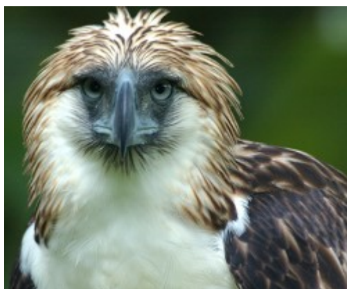
The critically endangered national bird of the Philippines