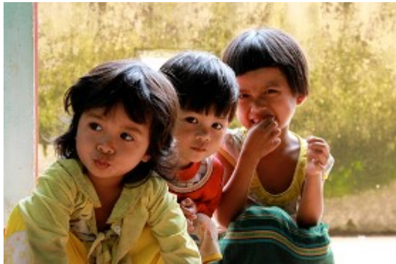
Forests and child support in Vietnam