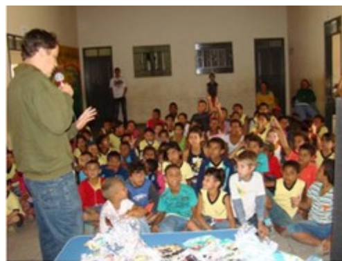
Lecture to children on environment

In 2012, we provided suggestions for sustainable use of national parks and the development of conservation action plan. We have also conducted afforestation of about 450 ha as a three-year plan in order to restore ecosystems in the water source areas. Moreover, environmental education programme for local children have achieved a great success.