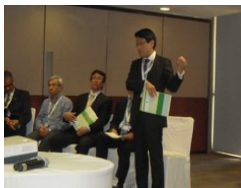
Dialogue on biodiversity between Japanese and Indian companies at COP11

At the CBD COP11 held in India in October 2012, we organized a session to exchange views with Japanese and Indian companies which are actively involved in biodiversity conservation, and drew attention.