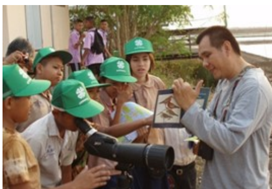
Children learning about birds and the tidal flat