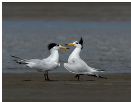
The mythical bird; Chinese Crested Tern

Chinese Crested Tern was thought to be extinct, but their survival was confirmed in China in 2000. The Chinese Crested Tern is critically endangered species with a known population of less than 30 birds, and there are only two known breeding sites in the southeastern coast of China. BirdLife International has been urging to prohibit collecting eggs at the breeding sites, and started a project in 2012 to restore a formerly