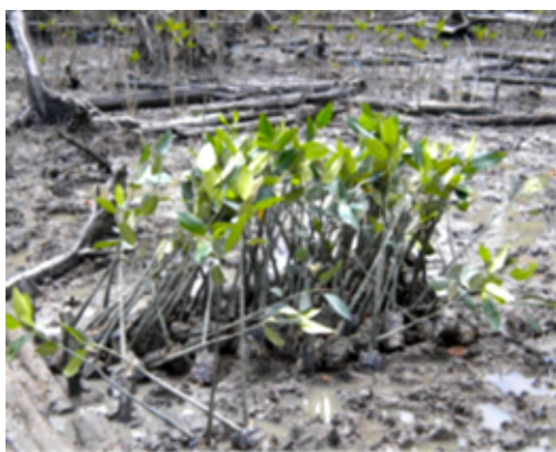
Seedlings of endemic mangrove species

In Philippines, the restoration of tropical rainforests in a way with low impact on ecosystem is conducted in Mindoro Island and Luzon Island, where seedlings collected from mountains by local people have been transplanted after being grown in the nursery seedbeds. Local people have also raised the trees that bear well in home gardens, and sold the surplus fruits in the market to increase their income.