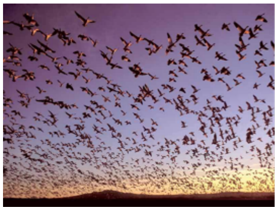
Migratory birds crossing borders

The flyway which is used by migratory birds coming to Japan is called the East Asian-Australasian Flyway (EAAF), and an international framework for the conservation, “Partnership for the East Asian- Australasian Flyway (EAAFP)”, was launched in 2006. BirdLife International is participating in the EAAFP with the Ministry of the Environment and other bird conservation organizations, and is in charge of the Japan secretariat for the EAAFP. Also, Birdlife is in charge of the