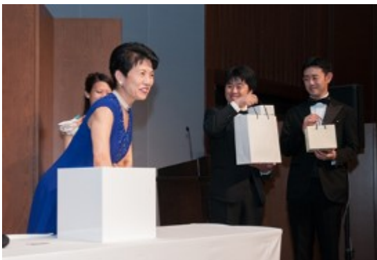
Lottery for Raffle