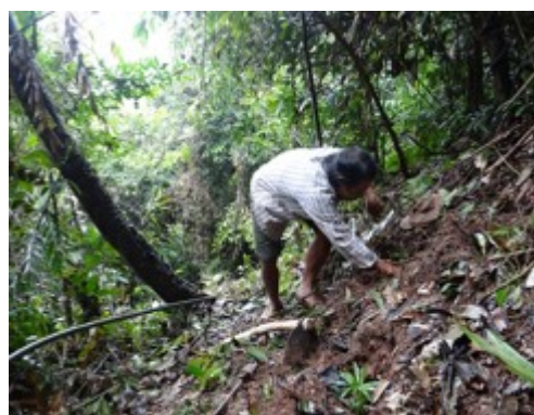
Indigenous people planting rattan trees

In central western Vietnam, we are working on forest conservation using agroforestry and activities to improve local people’s lives with support from Toyota Environmental Activities Grant Program. As the poorest indigenous people live in the area where chemical defoliants were sprayed extensively during the Vietnam War, we plant cash crops rattan there and provide technical support and training on planting or processing of rattan to local people.