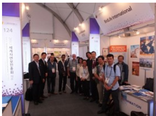
BirdLife Booth at the IUCN World Conservation Congress

Many major conferences on environment were held in 2012. Environmental issues were discussed throughout the year – it started with the 6th meeting of partners for Flyway Partnership (Indonesia) held in March, and followed by the Rio + 20 Earth Summit (Brazil) to mark the 20th anniversary of the first Earth Summit in June, the 11th meeting of the Conference of the Contracting Parties to the Convention on Wetlands (Ramsar COP11) (Bucharest, Romania) in July, IUCN World Conservation Congress (Korea) in September, and the 11th meeting of the Conference of the Parties to the Convention on Biological Diversity (CBD COP11) (Hyderabad, India) in October. BirdLife International is addressing problems in close coordination and working together with the secretariats of above Conventions. At the Ramsar COP11, Tokyo Office staff announced the achievement that several wetlands in Asia were newly registered under the Ramsar Convention. Moreover, at the CBD COP11, we actively presented recommendations, based on our knowledge, about marine reserve selection and conservation of marine ecosystem. We also took the initiative in business and biodiversity during the convention along with Japanese & Indian companies.